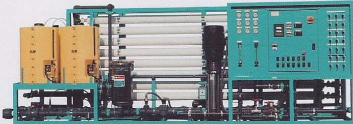
MODEL DELTA-30HF 43,200 GPD of High Purity Water