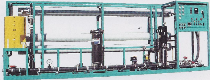
MODEL DELTA-50HF 72,000 GPD of High Purity Water