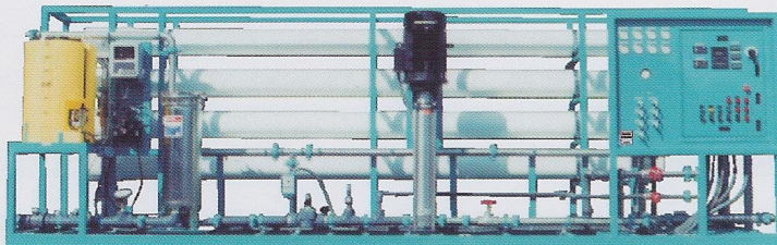
MODEL DELTA-60HF 86,400 GPD of High Purity Water