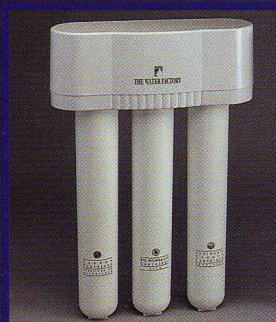
SQC 1, 2, 3 HIGH PERFORMANCE RO SYSTEM

* SQC 2, SQC 3 and SQC 4 Nitrate Series only