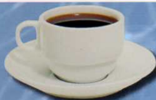
Robust, great-tasting coffee or tea.