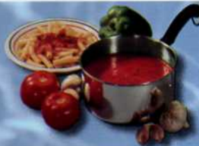
Bolder tasting food, soups and sauces.